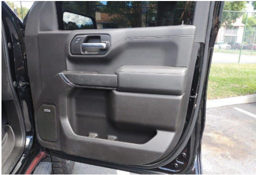
PASSENGER DOOR PANEL