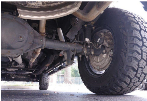
UNDERCARRIAGE REAR RIGHT