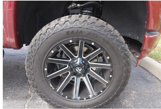
FRONT RIGHT TIRE/WHEEL