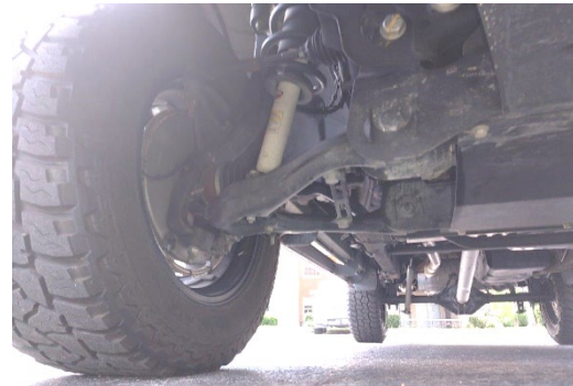
UNDERCARRIAGE FRONT RIGHT