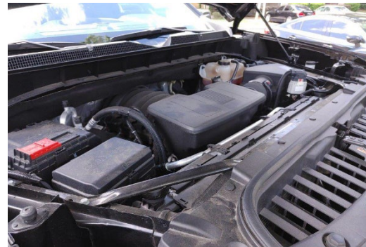
ENGINE RIGHT CORNER