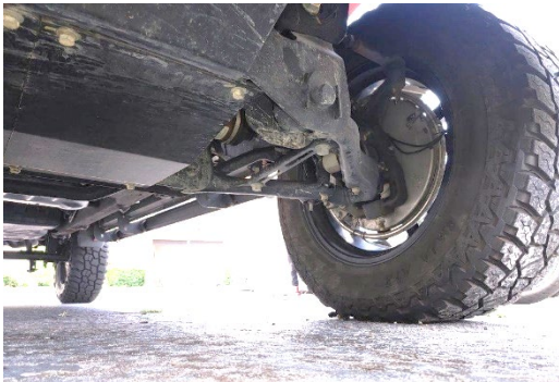
UNDERCARRIAGE FRONT LEFT