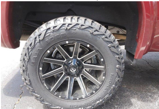
REAR RIGHT TIRE/WHEEL