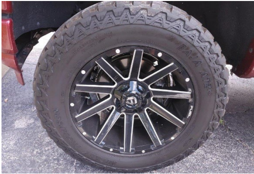
FRONT LEFT TIRE/WHEEL