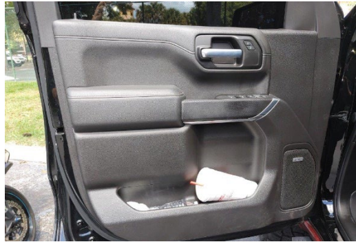
DRIVERS DOOR PANEL