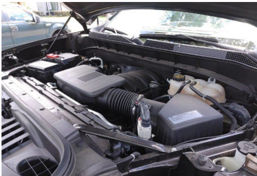
ENGINE LEFT CORNER